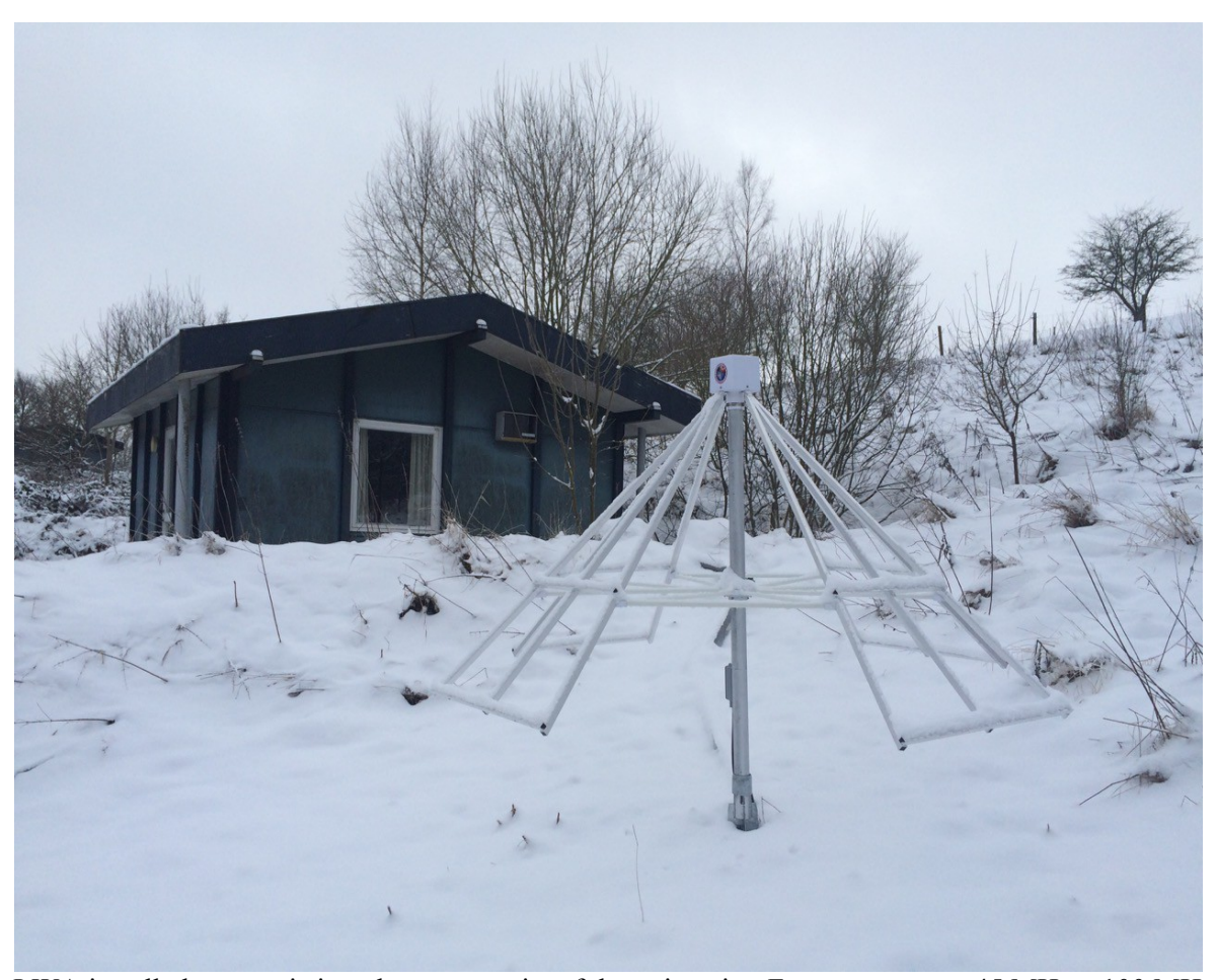
Fig. 1: LWA installed at an existing observatory site of the university. Frequency range 45 MHz – 100 MHz

Recently, a new long wavelength station in Denmark has been set into operation at the Technical University of Denmark. It is a dual linear polarization frequency agile solar radio burst spectrometer based on two Callisto spectrometer.